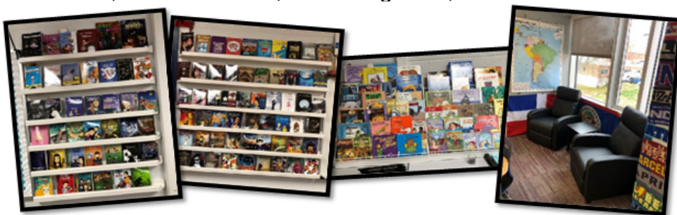
Figure 1. Photos of materials and furniture purchased to implement FVR.

During the summer preceding the 2019-20 school year, I acquired a grant that provided funds to develop an extensive classroom library of reading materials in addition to furniture that permitted comfortable flexible seating options and aesthetic organization of the materials that permitted access (see Figure 1). In recognition of the multitude of benefits of pleasure reading - both in the first and target languages - this project intended to develop a classroom library of reading material with which students could engage freely according to the range of their abilities and interests. A classroom library that truly meets the needs of diverse learners requires certain characteristics: 1) diverse themes, 2) diverse and compelling characters, 3) tiered access, 4) varied literary genres (e.g., fiction, nonfiction, biography, magazines, graphic novels, etc.), and 5) a comfortable and safe space that invites focused pleasure reading. As such, this project requested funds to develop a library of over 100 titles (see Appendix A) obtained from a variety of publishers dedicated to creating target language materials designed for the language learner within a wide variety of abilities. Small furniture items related to material organization and flexible seating options were also purchased. The materials were organized primarily by their accessibility level as evidenced by characteristics such as total word count, unique word count, visual scaffolds, use of cognates, etc.