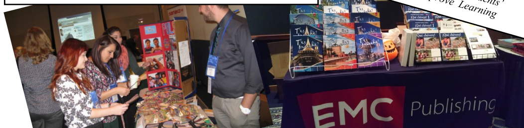
The Exhibit Hall was active throughout the conference with product sales and vendor products, demonstrations and workshops. EMC also sponsored the Wine and Cheese reception on Friday evening.