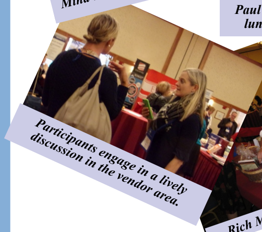
Participants engage in a lively discussion in the vendor area.